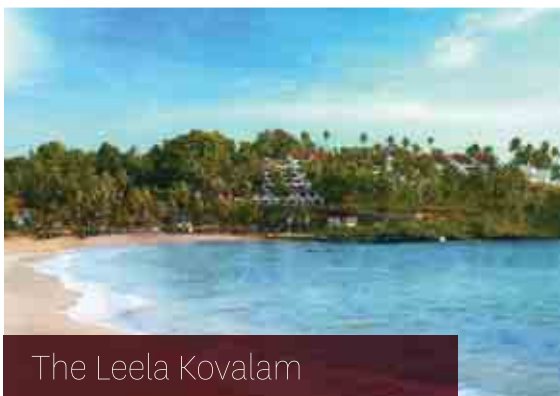
The Leela Kovalam