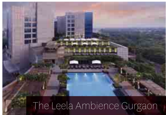
The Leela Ambience Gurgaon