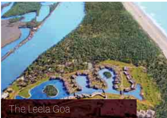
The Leela Goa