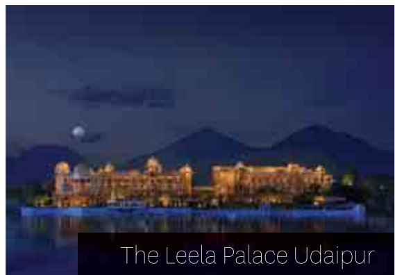
The Leela Palace Udaipur

Under Development: Bhartiya City, Bengaluru; Jaipur; Agra; Kathmandu; Chandigarh and Lucknow.