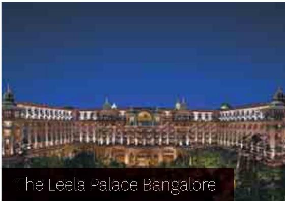
The Leela Palace Bangalore