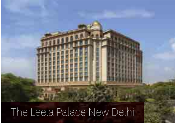
The Leela Palace New Delhi