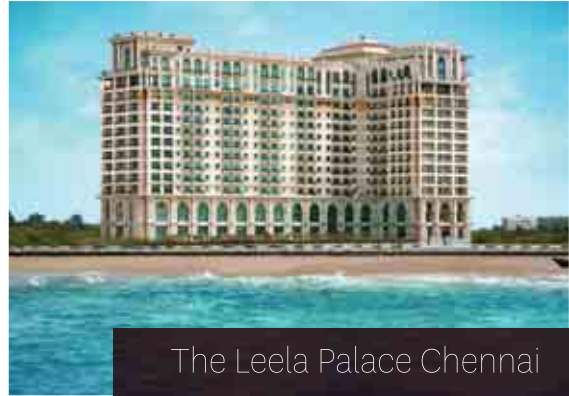
The Leela Palace Chennai