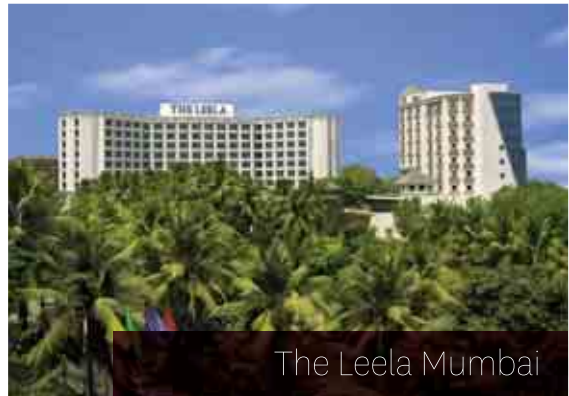
The Leela Mumbai